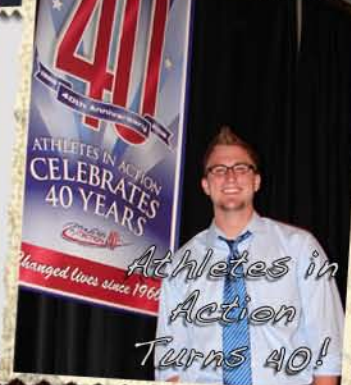
Athletes in Action Turns 40!