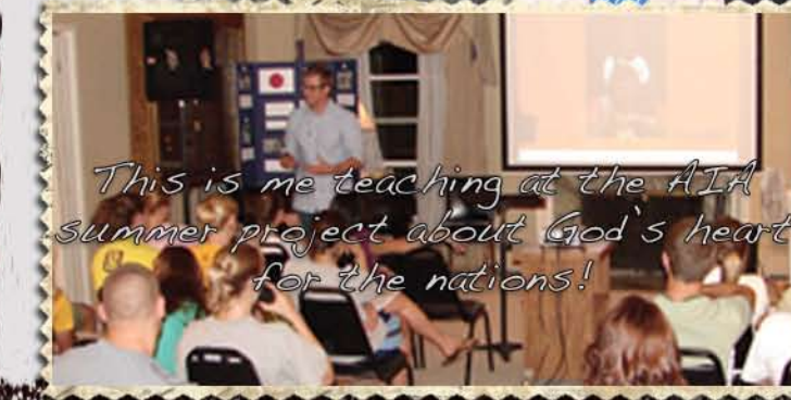
This is me teaching at the AIA summer project about God's heart for the nations!