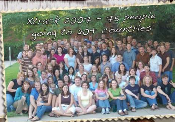
Xtrack 2007 - 75 people going to 20+ countries

Colorado, training out there and the staff conference were GREAT! BUT I was ready for things to wrap and move on from there. Here are some pictures and captions from notable people/events/ things from my two months there!